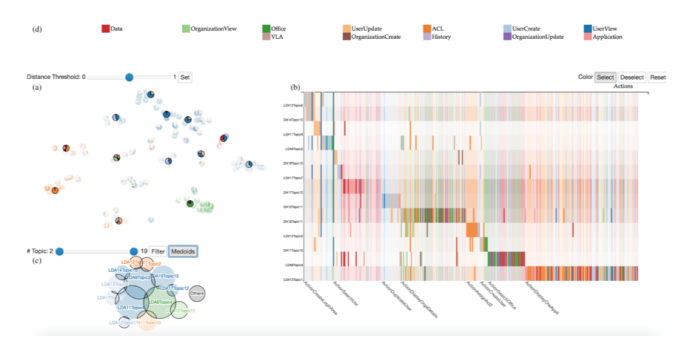
Figure 2: Visual analytics system for topic modelling based user behaviour analysis.

We build probabilistic models, one for each cluster provided through the topic modelling, to assess the anomaly of user activities. A score indicating the likelihood of certain actions being harmless, or harmful, is derived from Long short-term memory models (LSTM) [3]. These models output for each action its probability given the previous actions in the session. The score is then calculated from the probabilities provided by multiple LSTM models: one general LSTM that models the general behaviour of all users in the system, and an LSTM model for each cluster of sessions. The probabilities are then weighted by the similarity of the observed user session to each cluster.